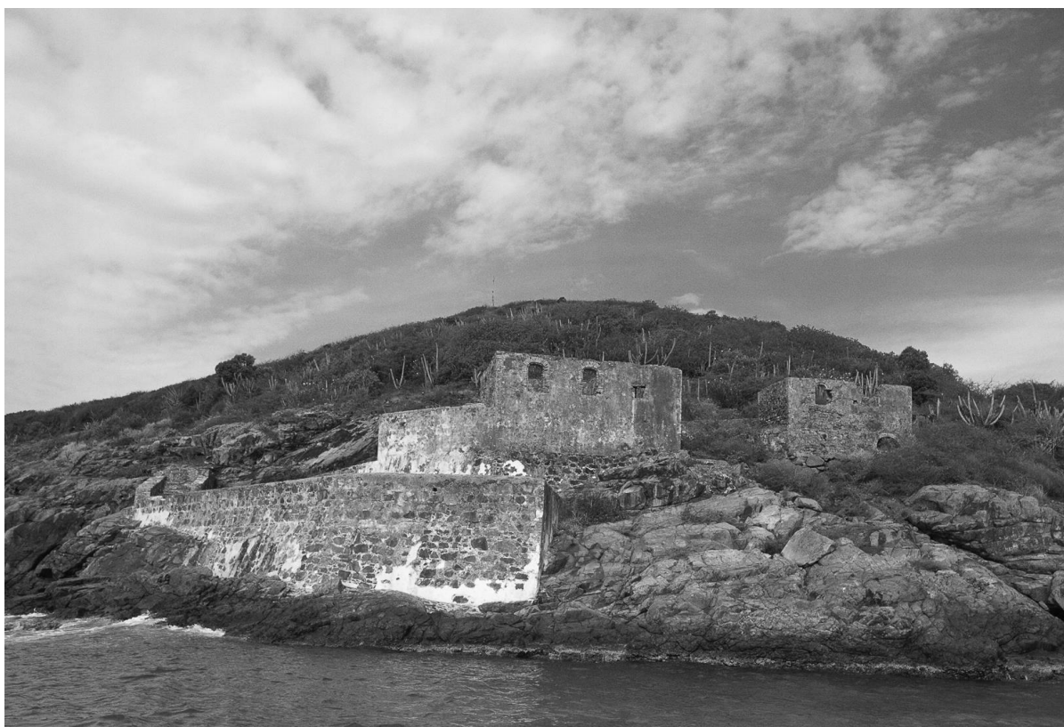
Figure 1. Prince Frederik's Battery

Also, dating from as early as the mid-19th century, Hassel Island contains important sites, architecture, and artifacts of steamship coaling stations and shipping depots of prominent companies, such as the Royal Mail Steam Packet Company (RMSPC) and Hamburg American Lines (now Hapag-Lloyd). A significant marine slipway and vessel repair station, Creque Marine Railway, is still present on Hassel Island. The large complex, established in the 1850s as the St. Thomas Marine Railway Company, contains a rare Bolton engine, and is proclaimed to be the last remaining example of a steam-powered marine railway in the Western hemisphere (Rumm, 1985). Sites on Hassel Island include resources from both World Wars, as U.S. naval troops were stationed in the old industrial depots.