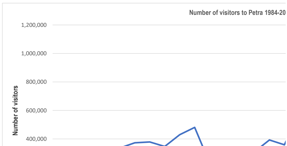
Figure 2: Number of visitors to Petra 1984-2018 (Visit Petra: www.visitpetra.jo , 2018; MOTA, 2018).